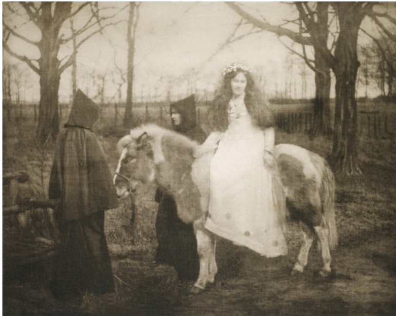
III. 2: James Craig Annan, L'Eglise et le Monde