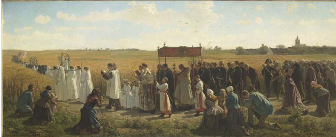
III. 4: Jules Breton, Harvest Blessing near Arras , 1857, Arras, Musée des Beaux-Arts

avoided instantaneous representations. To La Sizeranne, then, they showed a thorough and deep degree of premeditation. Instead of the mere and immediate representation of reality that Impressionists paintings seemed to give, these works were the result of keen reflection. Rembrandt and the Italian Renaissance masters were also among La Sizeranne's models.