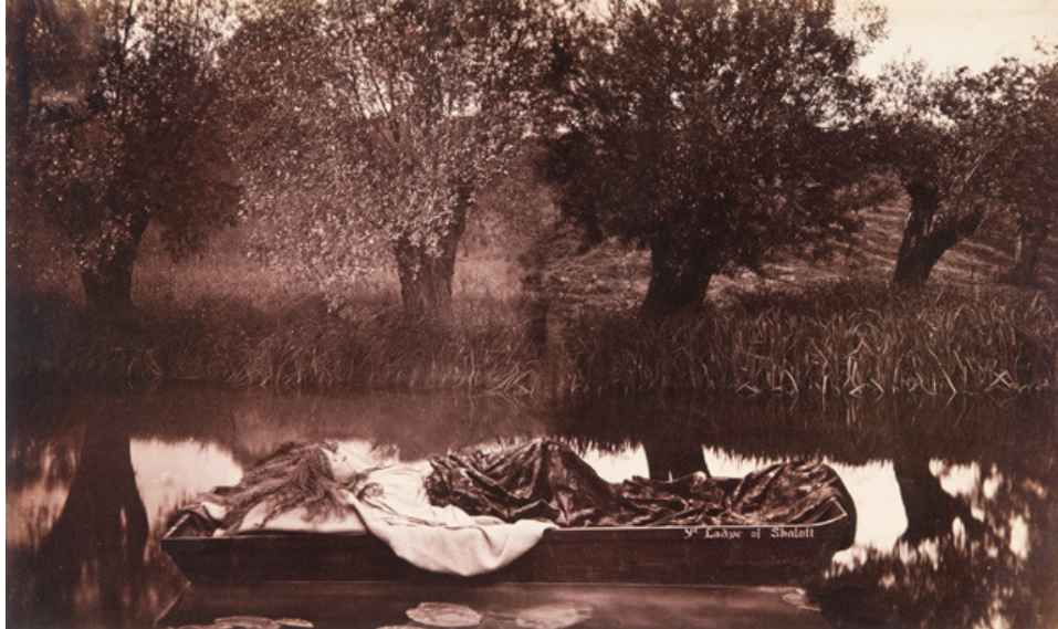
III. 3: Henry Peach Robinson, The Lady of Shalott , Bradford, the National Media Museum

La Sizeranne, too, rejected Impressionism. Impressionist paintings seemed ordinary to him, too close to the daily life of the time. The idea , he felt, was absent. Like most of the young fin-de-siècle writers, he was also critical of academic paintings for the dryness of their lines. A new way should be found. In his eyes, the choice of subjects and the expression of ideas were both crucial, as was the artist's ability to tell stories. Ut pictura, ut poesis . It explained his taste for Pre-Raphaelite pictures that referenced poems and essays. Celebrating the works of Rossetti and Millais, he also praised Henry Peach Robinson's photographs. 5 Peach Robinson started to work in the 1850s as a young man. His images were then quite closed to Pre-Raphaelite aesthetics. His Lady of Shalott was inspired by Millais's Ophelia and his melancholic She Never Told Her Love was an attempt to illustrate a famous line from Shakespeare, by way of one of Christina Rossetti's poems. (III. 3) Peach Robinson was still alive when La Sizeranne wrote and appeared to him as a model to be followed by photographers.