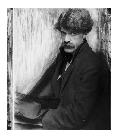
Fig. 6 Modern positive print from original glass plate negative Library of Congress

Similarly, Gertrude Käsebier's portrait of Alfred Stieglitz (fig. 6), printed two very different ways, is completely transformed by the processes used to render it. Stieglitz's expression shifts from assured, direct, and confident to brooding and, finally, to an almost menacing stare. Each print also represents a successive stage in a transformation from a recognizably photographic base to a draughtsman-like mass of black shadow that completely obscures any photographic detail. The first image is a more recent positive print produced probably by the Library of Congress from the original glass negative that they now possess. Although this version of the image should not be read as a work by Käsebier, it is helpful in that it reveals the amount of detail possible from the original negative, thereby emphasizing Käsebier's desire to obscure that detail in her actual prints.