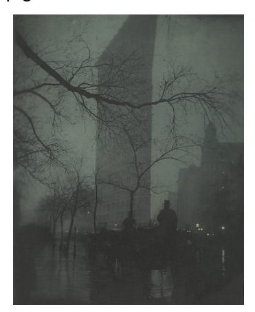
Fig. 5 The Flatiron, 1904

Over the course of five years, for example, Edward Steichen produced three masterful prints of The Flatiron (fig. 5), each one striking a different tonal chord in a palette of muted browns and greens. The building itself is rendered as a faint, but foreboding presence, a glimmer of the future breaking the horizon and emerging from the fog of memory. Among other things, these prints reveal that the impression of atmosphere was partially manufactured by Steichen's hand; the lamps in all three prints are lightly illuminated by the addition of pigment.