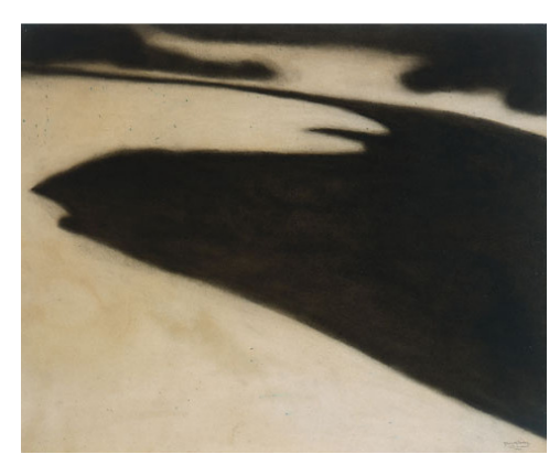
Fig. 4 George H. Seeley (American, 1880–1955) Winter Landscape, 1909 Gum bichromate and platinum print Metropolitan Museum of Art

The paradox is, of course, that even when these works seem to conform to romantic notions of the artist's gesture, informed by individual vision and spontaneity, they are in fact often the products of something as formulaic as a recipe and hours of tedious work in the darkroom.