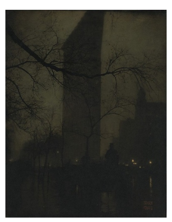
The Flatiron, 1904, printed 1905