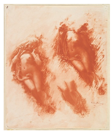
Fig. 1 René Le Bégue (French, 1857–1914) [Study in Orange], 1902 Gum bichromate print Metropolitan Museum of Art

expression." How strange then that, for many Pictorialists, photography's unique expression was best exemplified by elaborate printing processes that echoed and even imitated paintings and drawings? As if in response to Stieglitz's anonymous debate partner, who lamented that photographs were not paintings, Pictorialist photographs often masquerade as paintings (or charcoal sketches or chalk drawings), intent on disguising whatever mechanical origins they might possess.