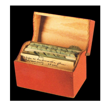
Fig. 3 George Seeley's Recipe Box. George Henry Seeley Papers Yale Collection of American Literature Beinecke Rare Book and Manuscript Library.

another will produce "Softer results." One card is even titled "Old Master," perhaps the chemical formula for a process that produced something like Le Bégue's masterful gum print imitating a chalk drawing. Seeley's archive also includes a tool, the Willo Visible Dodger, which facilitated the manipulation of light during the exposure of a print. As the manufacturer proclaimed on the package: "The Willow Visible Dodger allows the operator to paint with light."