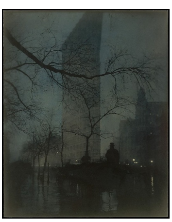
The Flatiron, 1904, printed 1909