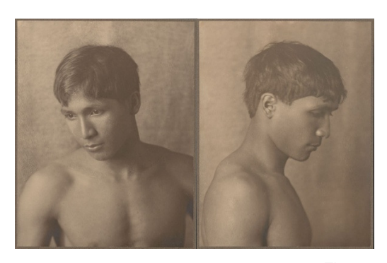
Fig. 10 Caroline Haskins Gurrey (American, 1875–1927) Portrait of "Japanese-Hawaiian" boy (frontal and profile), 1909 Gelatin silver prints National Anthropological Archives, National Museum of Natural History, Smithsonian Institution

Gurrey claims to have made these pictures to celebrate the diversity of Hawaii's ethnic composition, but regardless of her original intention, these pictures would find their way into highly conflicted and problematic venues. In 1909, all fifty were exhibited at the Alaska-Yukon-Pacific Exhibition in Seattle, whose express purpose was to promote the "exploitation" of AYP resources, including Hawaii. They were displayed in the ethnographic section of the show, where visitors were served pineapple by attractive young Hawaiian girls. As Heather Waldroup writes: "Juxtaposed with the sweetly excessive pleasures of the pineapple pyramid and sugar palace [nearby], Gurrey's photographs conveyed a life in Hawaii that