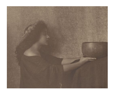
Fig. 7 Caroline Haskins Gurrey (American, 1875–1927) Portrait of young "Italian-Hawaiian" woman holding large bowl, titled The Calabash, 1909 Gelatin silver print

Until now, this discussion has focused only on photographers who have long been considered central figures in the Pictorialist movement. But aside from the important circles in New York, London, Paris, and other major cities around the world, Pictorialist photographers also established practices in many smaller communities in far-flung corners of the globe. Take, for example, the case of Caroline Haskins Gurrey, who moved to Hawaii in 1901 to work for a portrait photography studio. A year later, her work was being lauded as "the finest specimens of art photography on the islands." It remains unknown if she had any direct correspondence with Stieglitz or any other Pictorialist figure, but Gurrey seems to