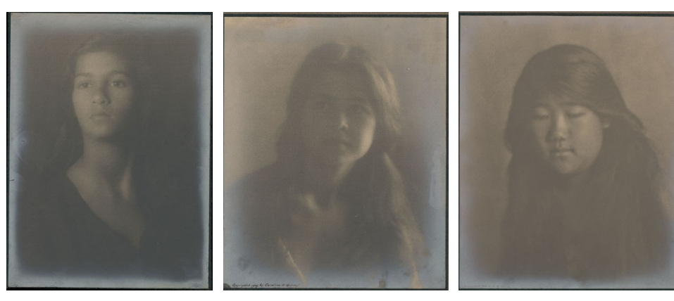
Fig. 8 Caroline Haskins Gurrey (American, 1875–1927) Portrait of "Indian-Hawaiian" girl Portrait of "Irish-Hawaiian" girl Portrait of "Japanese-Hawaiian" girl Gelatin silver prints National Anthropological Archives, National Museum of Natural History, Smithsonian Institution

In this sense, these pictures are akin to the work of photographers like Jacques-Philippe Potteau and Louis Rousseau, who undertook a massive project to compile pictures of racial types for the Musée de l'Homme (Museum of Man) in Paris in the 1860s. Figure 9 illustrates