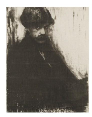
Gum bichromate print Private Collection, Courtesy of Hans P. Kraus, Jr., New York

The Photo-Secessionist's deliberate privileging of uniqueness and singularity is somewhat at odds with their willingness to distribute their work in the form of photomechanical reproductions in Camera Work . It is true that the photogravures included in the journal were expertly created and often replicated the range of tones found in the original prints, but each one was precisely like the next. What's more, the luxurious photogravure process was not the only reproductive process used. During its run, Camera Work would include half-tone reproductions, three-color prints, offset prints, and others, forming a veritable collection of early twentieth-century printing technology and perhaps pointing to Stieglitz's dissatisfaction with any one process and his restless attempts to find the most appropriate form of reproduction. As if to preempt the debate, Stieglitz admitted in the first essay of the first issue (titled "An Apology") that "no reproductions can do full justice to the subtleties of some photographs."