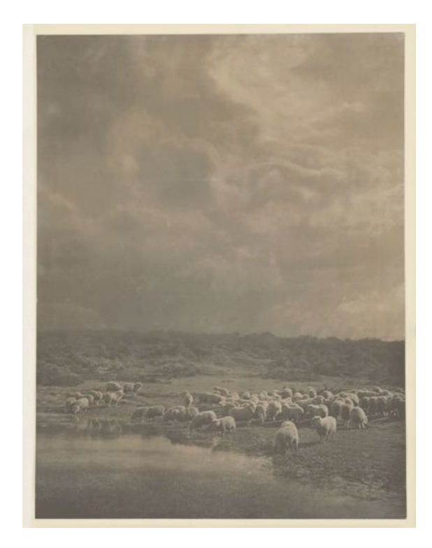
H.P. Robinson, Sheep in a Storm , Platinum print, 1894, 47.9 x 36.4 cm, Ernst Juhl Collection, Kunstbibliothek Staatliche Museen zu Berlin - Preußischer Kulturbesitz, Id. Nr. 1915,251.

In contrast to Böhmer's sheep, English photographer Henry Peach Robinson's (1830–1901) image on platinum print dated 1894, Sheep in a Storm, appears almost dramatic. The cloudy sky takes up two-thirds of the image. In the case of Robinson, we can assume the use of combination printing. The sheep appear to have been shot in radiant sunshine, whereas the sky is bleak and clouded. The sheep also provide another clue: none of the sheep are unclear, therefore the exposure time must have been short, which would not have been possible in weak sunlight. The stripes on the horizon line, indicating rain, could have also served to cover up contour lines to make the combination printing of the negative invisible to the viewer.