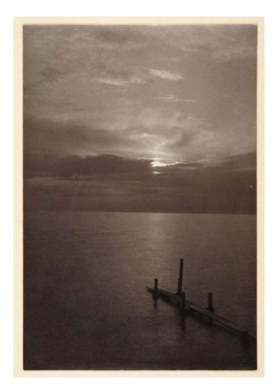
A. Böhmer, When Day Declines , carbon print, ca. 1900, 15.8 x 20 cm, Ernst Juhl Collection, Kunstbibliothek Staatliche Museen zu Berlin - Preußischer Kulturbesitz, Ident-Nr. 1915,327.

The backlit photograph was mentioned by Francis Wey in his previously quoted 1851 issue of La Lumière in an article on the Parisian photographer's album. Though he is against the subsequent addition of a fantasy sky by hand, which through the mix of painting and photography produces a hybrid (image-hybrid) in which the sky appears monstrous and contradicts the detailed naturalistic reproduction of the other objects, he believes that the sky can be given the desired atmospheric appearance through use of the appropriate photographic technique. As an example, he quotes the French painter and photographer Charles Nègre (1820–1880), who achieved this with three shots of a day coming to a close in the twilight. He draws particular attention to one of the photographs titled Le Soir : Above the silhouettes of the trees, which surround a farm in shadows, a perfect sky ("un ciel complet") can be seen, comparable in its harmony to the painted skies of panel paintings.<sup>17</sup> In his photography manual, published in 1891, the Berliner photo chemist Hermann Wilhelm Vogel (1834–1898) also describes backlit photographs as a method for achieving "painterly" effects.<sup>18</sup>