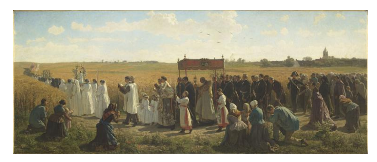
III. 4: Jules Breton, Harvest Blessing near Arras, 1857, Arras, Musée des Beaux-Arts

avoided instantaneous representations. To La Sizeranne, then, they showed a thorough and deep degree of premeditation. Instead of the mere and immediate representation of reality that Impressionists paintings seemed to give, these works were the result of keen reflection. Rembrandt and the Italian Renaissance masters were also among La Sizeranne's models.