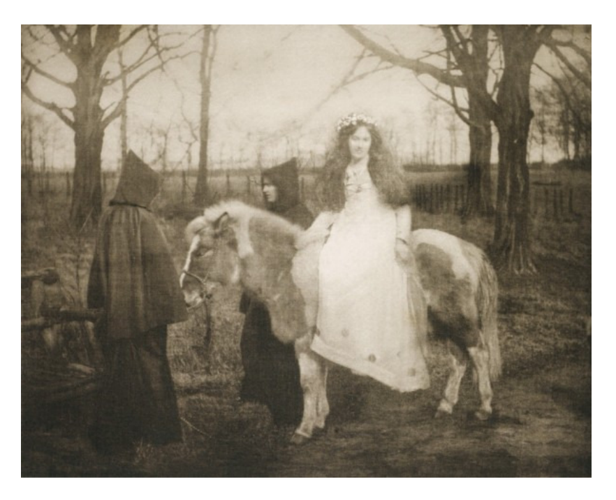
III. 2: James Craig Annan, L'Eglise et le Monde